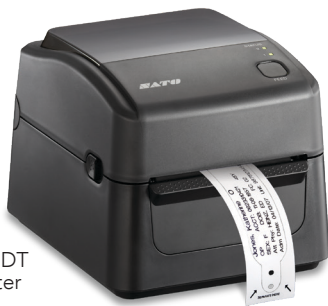
WS4 DT Printer

CG and WS4 Series Printers are Cerner® Validated