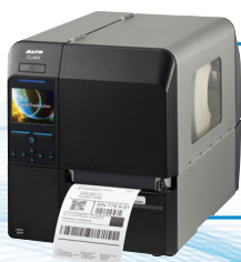
CL4NX RFID ✓