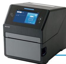
CT4LX RFID ✓