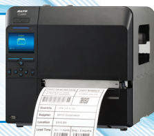
CL6NX RFID ✓