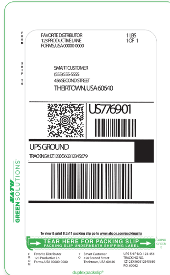
FRONT Shipping Label